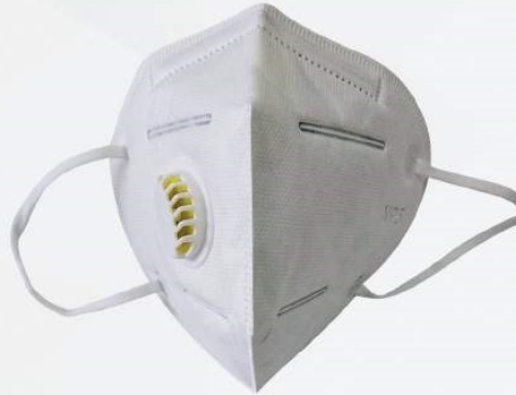
PRODUCT NAME : N95 MASK WITH RESPIRATORY VALVE PART NO - 5P95V

SCOPE OF APPLICATION: USED FOR DAILY PROTECTION TO BLOCK BODY FLUID, BLOOD SPLASHED OR SPLASHES.