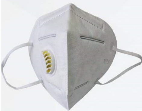
PRODUCT NAME : N95 MASK WITH RESPIRATORY VALVE PART NO - 5P95V